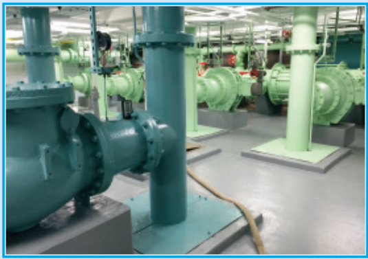
Water Treatment Plant Lower Water Room