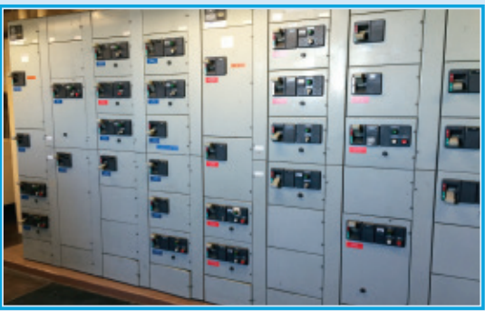
WTP Switch Gear – Showing red/blue tags identifying the power grid feeding the panels