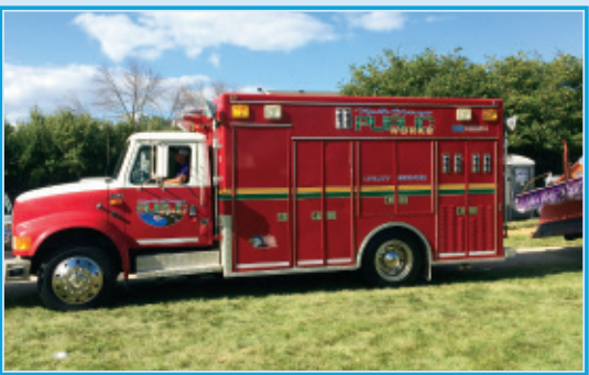
Water Break Tool Truck